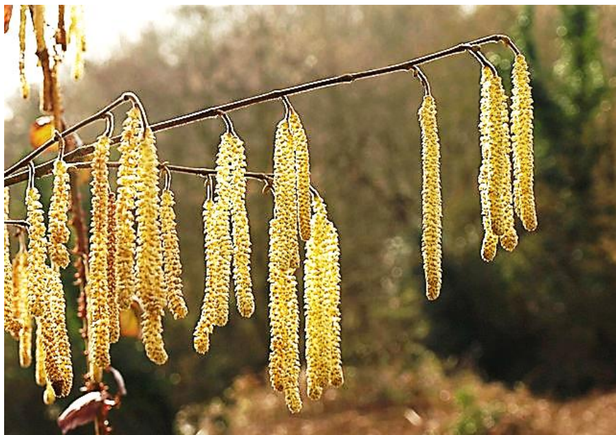
Hazel catkins, Exwick Barton