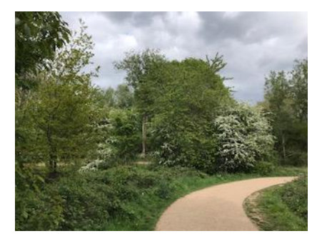
Hawthorn along Woodgate Valley

Cow parsley on Rea Valley cycle way Victoria Common