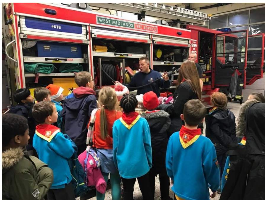
Beavers at Northfield Fire Station