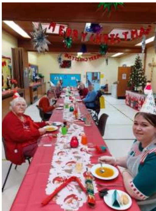
Day Centre Christmas Party